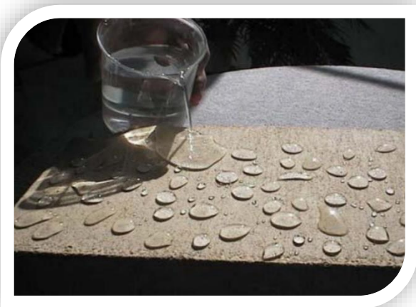
Water repellent effect on a concrete block containing silicone

Eco Seal Natural emits almost zero toxic odours (VOC's) and is water based, making it safe to use and minimising environmental impact.